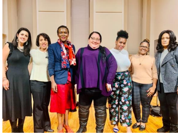
International survivor leaders coming together to discuss the violent, colonial roots of the sex trade.