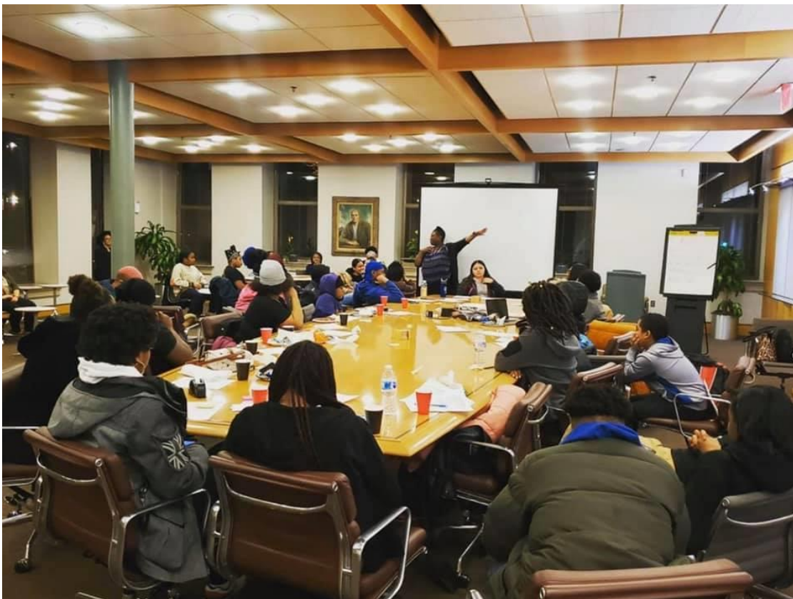
DC youth strategize on policy reform at our DC Girls' Coalition Youth Advisory Council meeting.

Last month, we also hosted two listening sessions for DC girls with our partners at the Georgetown Juvenile Justice Initiative. Young women and girls were provided a safe space to not only share about the obstacles they face, but also their solutions to dismantling those barriers. Their powerful insights will inform our upcoming Girls Workshop Series for girls of color impacted by the criminal legal system set to launch in the spring.