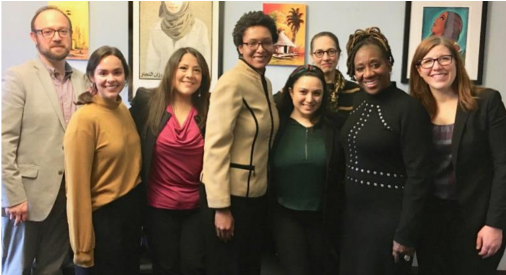
R4G and allies meet with Congressional staff to discuss legislative priorities for 2020.

As always, our work would not be possible without your support. Please consider making a gift to help us continue our critical work and advocacy on behalf of vulnerable young women and girls.